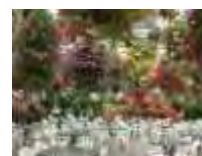
Kobe Kachoan, Welcome Reception venue