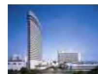
Kobe Portopia Hotel, Official Congress Hotel