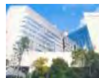
Kobe Int'l Conference Center