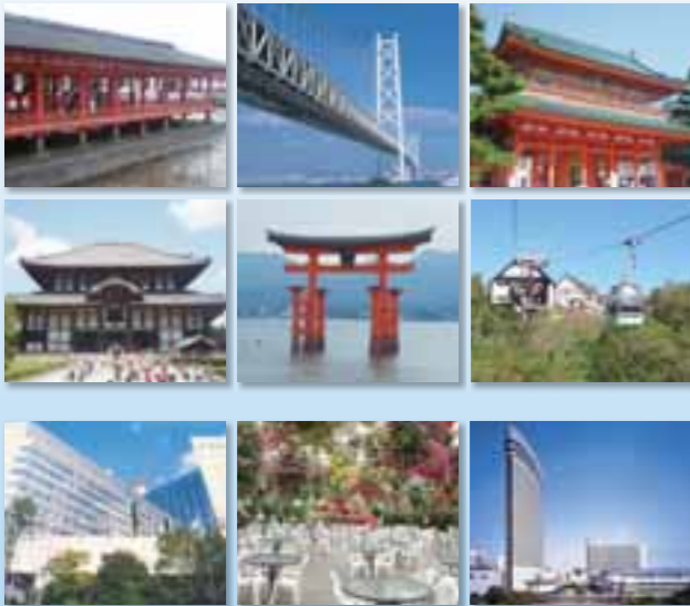
Kobe Int'l Conference Center Kobe Kachoan, Welcome Reception venue Kobe Portopia Hotel, Official Congress Hotel

Although not officially listed, following are also providing support with our publicity: American Society of Criminology, European Society of Criminology, and Criminal Law Society of Japan.